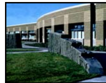
Utah State Library Public Art "Enduring Spirit" 1999-Robert Sindorf