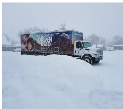
The Sanpete/South Juab County Bookmobile operating on a winter day.